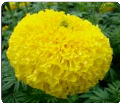
Marigold- F1 Tokyo Yellow

excellent hybrid variety, round shape fruit with hard net on the skin, orange sweet flesh, fruit weight 1.5 kg to 2 kg, tolerant to major disease and virus.