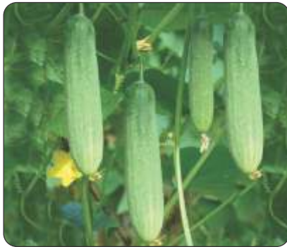
Cucumber F1 Natalia 74

Medium to long size cylindrical fruits, light green to green in color, good seed storage capacity, early maturity, maturity time 35-40 days, A product of