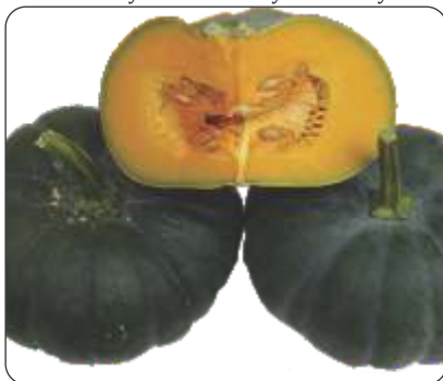
Pumpkin F1- Shivam

Green attractive color, plant height is 4.5 ft to 6 ft, maturity is 45- 50 days, tolerant to major disease and virus, excellent keeping quality, good in taste.