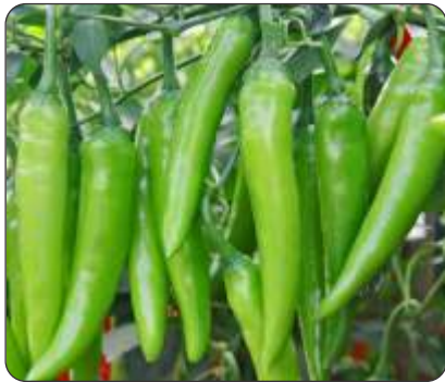
Chilli F1 Japanese Wonder

Green color fruits, high pungent in taste, maturity 60- 65 days after transplanting, fruit length is 9- 13 cm, high yielding, good keeping quality, tolerant to high temperature & disease.