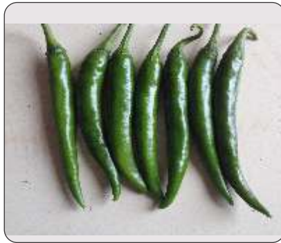
Chilli F1 Tadka 65

Green color fruits, high pungent in taste, maturity 60- 65 days after transplanting, fruit length is 9- 13 cm, high yielding, good keeping quality, tolerant to high temperature & disease.