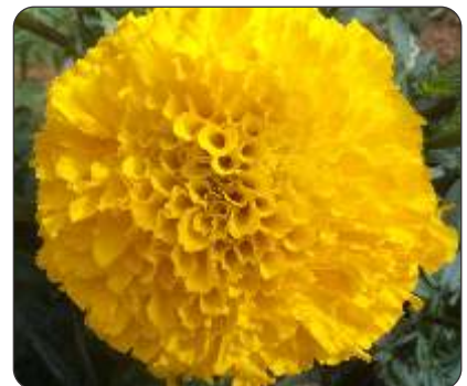
Marigold- F1 Ichiban 10

deep orange color flowers, good aroma, high yielding, maturity 55-60 days from transplanting, good keeping quality, good for storage and keeping quality,