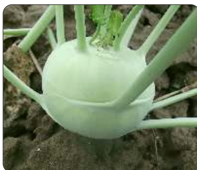
Kohl Rabi / Konl Khol - F1 Green Star

Shiny Green in color, Compact firm head, well good keeping quality, tolerant to major disease, good salad.