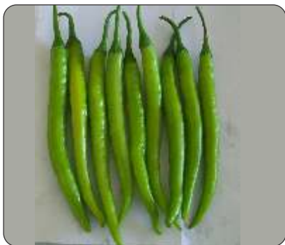
Chilli F1 Sophia

High pungent hybrid variety of chilli having wrinkles on skin, fruit length is 10-14 cm, maturity time is 60- 65 days after transplanting, perform well under high temperature, tolerant to disease and virus.