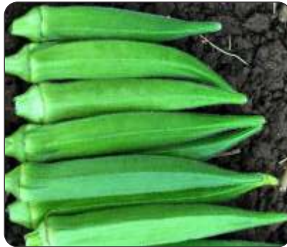
Okra- F1 – Krishma

Imported variety of Peas, dark green color pods and grains, 9-10 rains per pod, tolerant to major disease, sweet in taste, A product of ITALY and SWITZERLAND, maturity time is 75 days to 89 days.