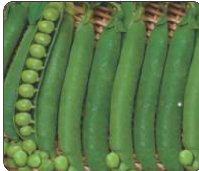
Green Peas-IB110 (Imported)

This is an excellent tall variety of coriander from ITALY, slow bolting, multi cuts, good aroma, broad leaves, widely accepted in Indian market