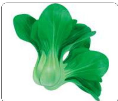
Pak Choi Greeny

Attractive Gold - Yellow color flower, good aroma, good for storage and keeping quality, plant height is 3.5 ft to 4.5 ft, good for Rabi and kharib, maturity 55-60 days from transplanting, tolerant to disease