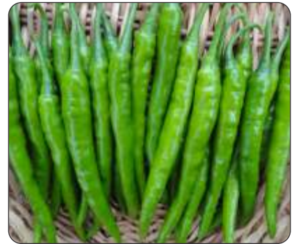
Chilli F1 Tokyo Hot

This Hybrid variety is good for both fresh consumption and dry purpose, fruit color is dark green to red in color at maturity, medium size fruit with length 7- 10 cm, tolerant to disease and virus.