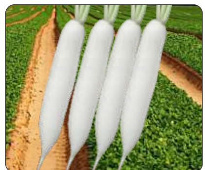
Radish Chetki- Long

a very early variety of radish, roots are pure white and long, leaves are smooth and used as palak/spinach, maturity time is 38- 42 days, good keeping quality.