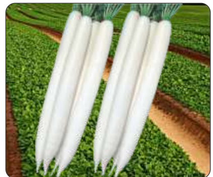
Radish F1 – Ashwariya

very good hybrid variety of pumpkin, fruit weight is 3- 5 kg, orange flesh color, round flattish in shape, maturity time is 80-90 days, tolerant to disease and virus.