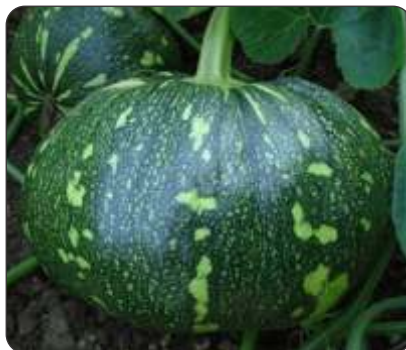
Pumpkin F1 – Aruna 82

High yielding hybrid pumpkin variety, fruit weight is 2.3 kg to 3.5 kg, flat round shape, flesh color is yellowish orange, maturity time is 85- 90 days,. A product of THAILAND.