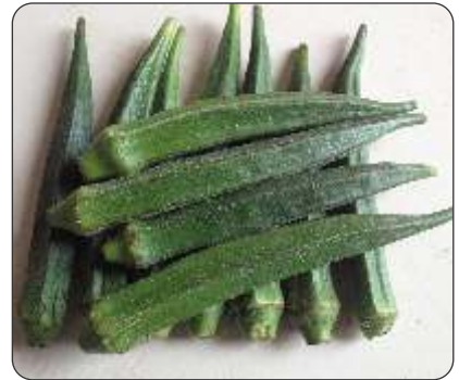
Okra/ Bhindi- Mahi Selection

Green to dark green color, good vigorous, prolific branching, high yielding, tolerant to yellow vein mosaic virus and other disease, early maturity, good for all season.