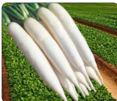
Radish – Surabhi

long roots, early maturity, roots are smooth and free from hairs, maturity time is 45- 50 days, A product of ITALY,