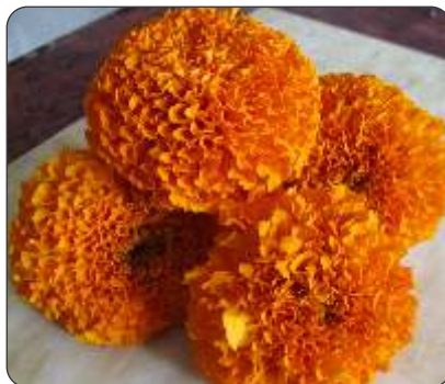
Marigold F1 Super Malta

attractive yellow color flower, good aroma, good for storage and keeping quality, plant height is 3.5 ft to 4.5 ft, good for Rabi and kharib, maturity 55- 60 days from transplanting, tolerant to disease