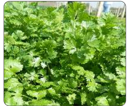
Coriander- Italiano imported

An excellent Selection variety of cucumber, dark green color and long size fruits, maturity time 38-40 days, high yielding,