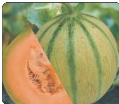
Muskmelon - Madhuras

Highly pungent variety, green color, fruit length is 11- 15 cm, maturity time is 65- 70 days from transplanting, good for fresh consumption, tolerant to major disease & virus.